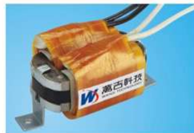
Reactor Inductor for Inverter of Solar Power 用于太阳能发电用逆变器的C型电感